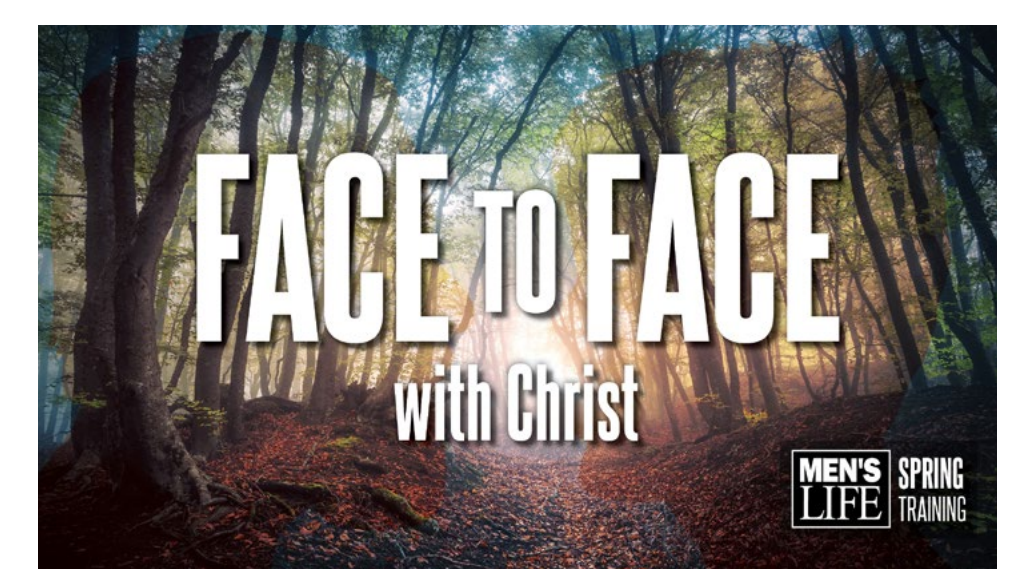
Men, join us from anywhere for a four-week course that'll reconnect you with our Savior. Tuesdays mornings this February. Details and registration at ml.mdpc.org .

Alpha is for everyone. It breaks down distance (and social distancing) barriers by meeting online to explore life, faith, and meaning. No question or comment is out of bounds, and you're free to say as much or as little as you wish. To sign up